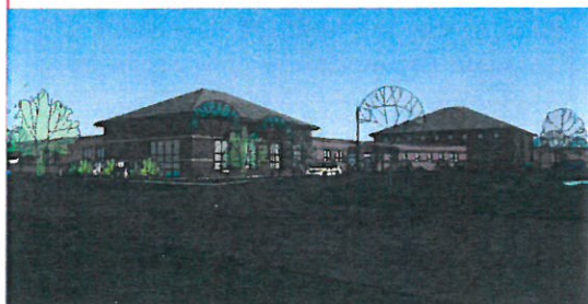
West Union Elementary