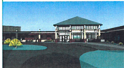
North Adams Elementary

Special programs for handicapped, preschool, all-day every-day kindergarten, extended enrichment program, and writing processes are in place. A vital element of the secondary program is the career and technical center that attracts approximately forty-five percent of all the juniors and seniors.