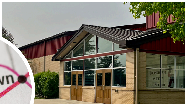
Johnstown Middle School - Grades 6-8 Enrollment - 395