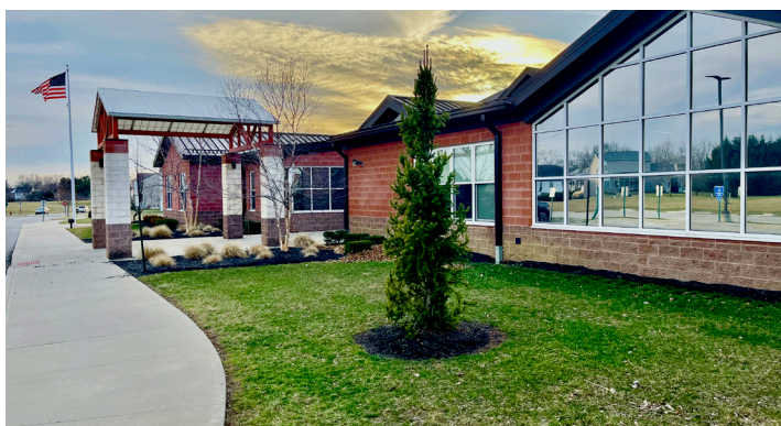
Johnstown Elementary School - Grades K-3 Enrollment - 505