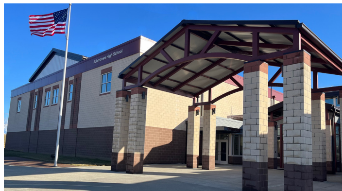
Johnstown High School - Grades 9-12 Enrollment - 555