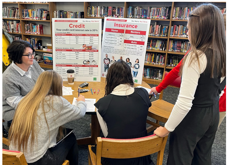
Johnstown Middle School students experienced "Real Money, Real World" exercises with the help of community volunteers. Topics included: paycheck withholdings, home ownership, budgeting, loans, credit, and insurance needs, among others.