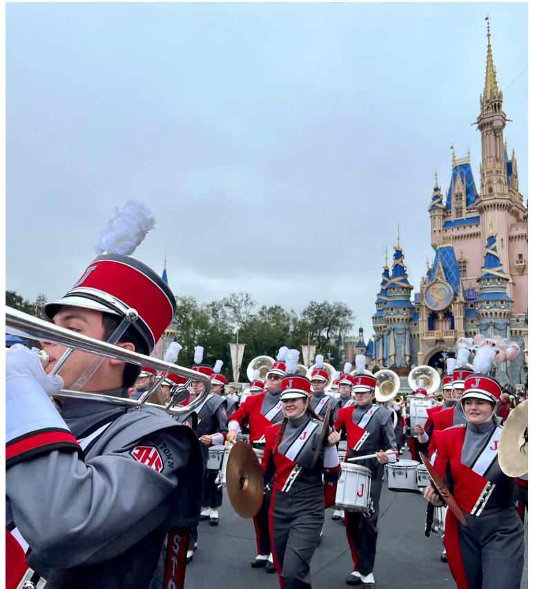
Johnstown High School's Big Red Band performed at Walt Disney World in December, 2022.

In 2022, the District launched an enhanced K-5 reading program. In 2023-24 we will implement a new K-12 Math series. Further curriculum refinements are being prepared.