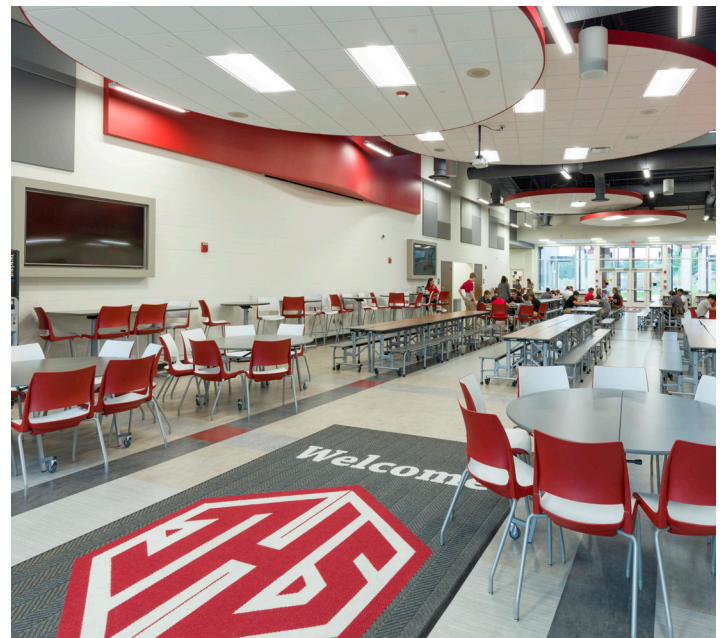
Johnstown High School Commons