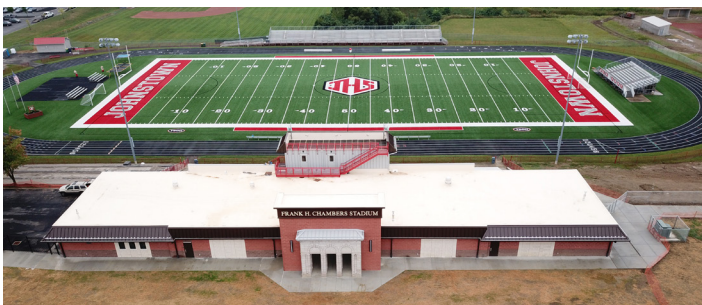
Frank H. Chambers Stadium

Deadline for applications is June 23, 2023