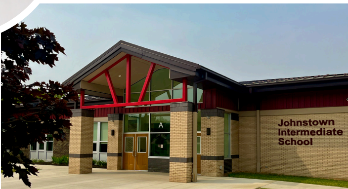
Johnstown Intermediate School - Grades 4-5 Enrollment - 260