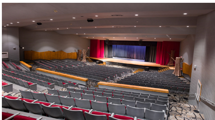
Johnstown Performing Arts Center